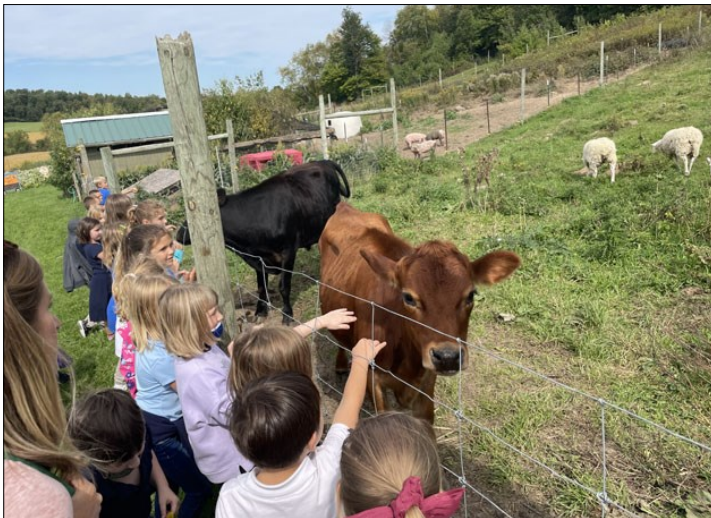
Second grade boys and girls get a close up look at the cows and sheep grazing at the orchard (above).

St. Charles second grade students visited Bushel and a Peck Apple Orchard to explore the life cycle of apple trees as part of their science curriculum. The boys and girls learned a little about entomology, explored the orchard, enjoyed a tasty treat, and had a friendly class competition through the corn maze!