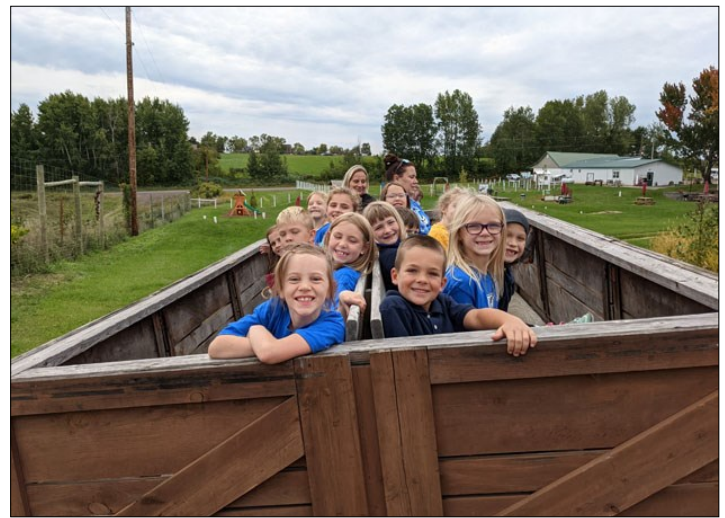
"Oh, what fun it is to ride" in a wagon at Bushel and a Peck Apple Orchard (above).