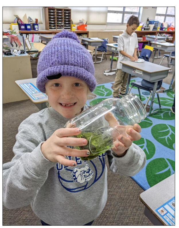
A second grade girl (above) finished her first Module of Wit & Wisdom called A Season of Change. The students learned to draw a chameleon, tried homemade applesauce and explored leaf chromatography.

I pray that Christmas morning and the coming New Year bring all of you good health!