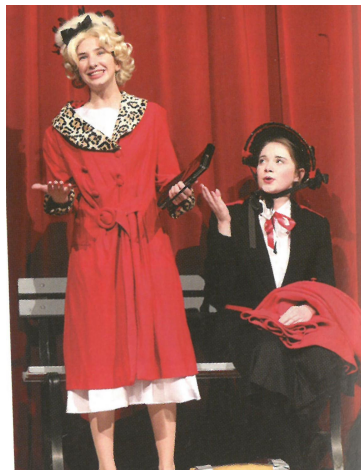
Photo taken from our last school musical, Guys and Dolls .