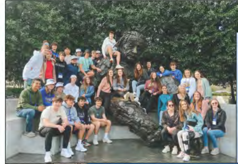
Left: Students at the Einstein statue, Washington, D.C.

Washington, D.C. and Gettysburg brought a lot of diving into history and a slower paced environment, which was liked by some of our students in comparison to the large amounts of people everywhere we went in New York City (NYC). While in NYC we all got to watch "The Lion King" on Broadway and some of our students had a change of heart about musicals and came to enjoy it by the end. Overall, it was a great trip and a great continuation of a McDonell tradition.