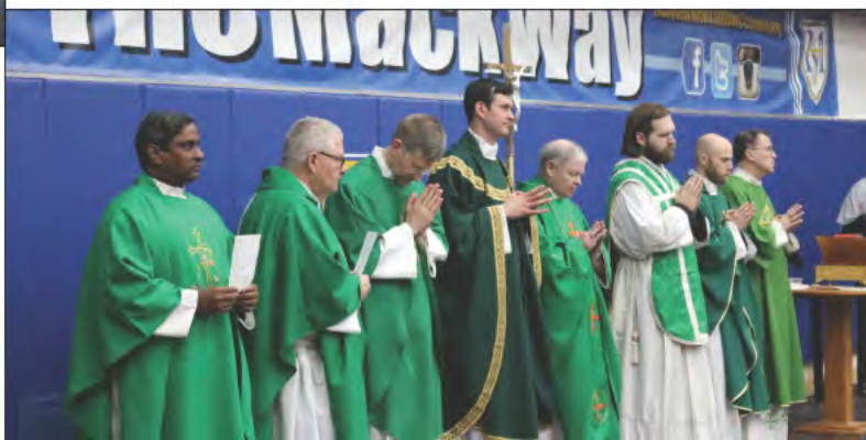
Below: Chippewa Falls Deanery Pastors, Associate Pastors, and Deacons celebrating Mass.