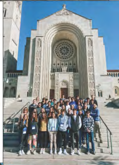
Above: Students visiting the Statue of Liberty. Left: Students and Chaperones after a visit to the Basilica of the National Shrine of the Immaculate Conception, Washington, D.C.