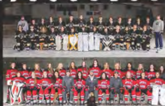
BOYS AND GIRLS