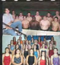
GIRLS AND BOYS