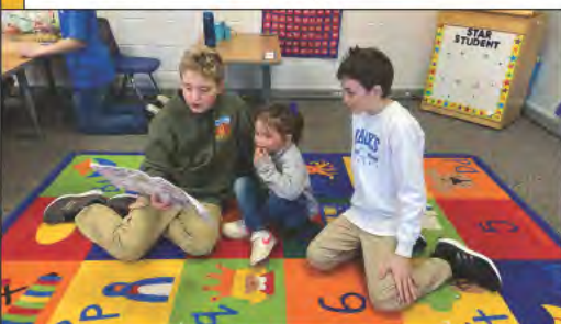
Left: Notre Dame Middle School students join a St. Charles Borromeo Primary student for storytime.

Scan the QR code above with your smart phone camera to watch #TheMackWay Day video.