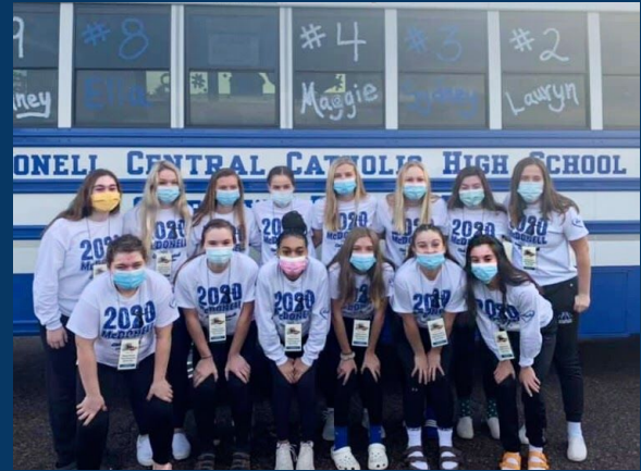
The girls team poses in front of a bus ready for state.

“The girls had such a great season and were so thankful to be able to play their whole season and make it all the way to the state tournament and bring back the silver ball to show their hard work and dedication they put in this year,” Roth added.