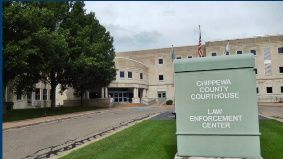
Chippewa Falls courthouse.

Once again, that time of year arrived in Chippewa Falls where the people determine who should stay and who should go. Citizens elected members of the community to positions in order to represent them and make decisions about how things should be run. This year in Chippewa County, there were six total positions available for election, consisting of the elections for the District 3 and District 7 Congressional Representatives, the District 67, 68, and 91st Representatives in the Wisconsin State Assembly, and the Chippewa County District Attorney.