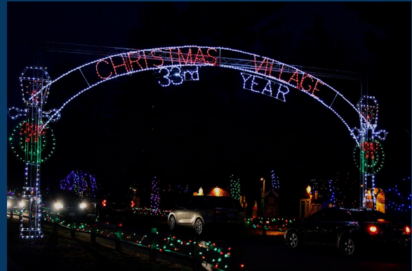
Lights illuminate the entrance to Irvine Park.