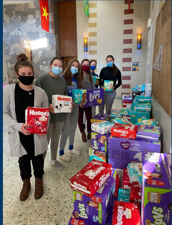
Ambassadors stand with the donations from the annual diaper drive.

pages and a guess jar, were still offered remotely as a way to attract the attention of the students towards the diaper drive.