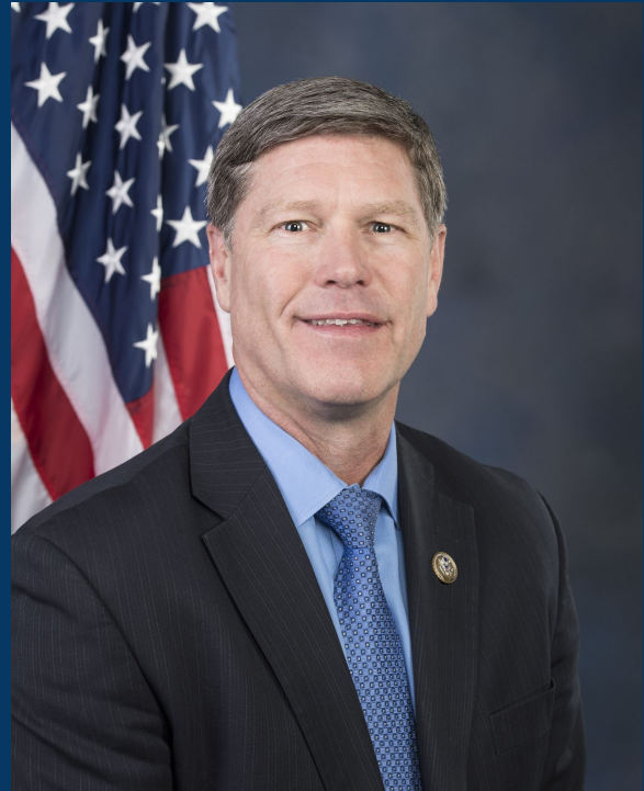
Rep. Ron Kind (D-WI District 3)