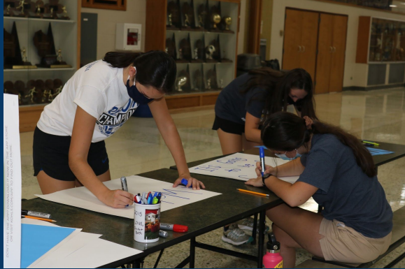
Ambassadors work in the commons.

Students who actively serve our school community through the Student Ambassador program have continued to help others this year, despite facing significant adversity due to COVID-19. The Student Ambassador program has taken measures to remain active while staying COVID-friendly.