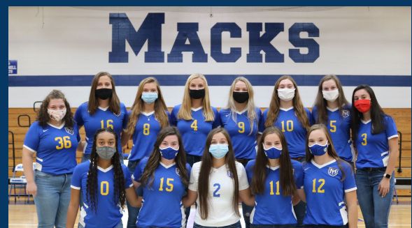
McDonell 2020 Varsity Volleyball