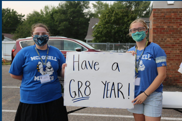
Ambassadors working at one of several drive-through events this year.