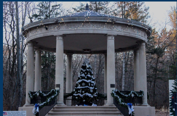
Irvine's pavilion decorated for Christmas.

The Spirit of Christmas is a non-profit organization established in 1988 that has been dedicated to helping children under 17 years of age celebrate the holiday. Volunteers help around 1,500 children each year. Gifts and monetary donations were given by individuals, businesses, and other organizations