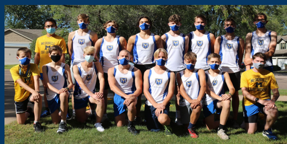
2020 McDonell Boys Cross Country